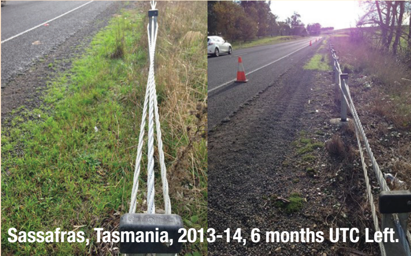
Sassafras, Tasmania, 2013-14, 6 months UTC Left.